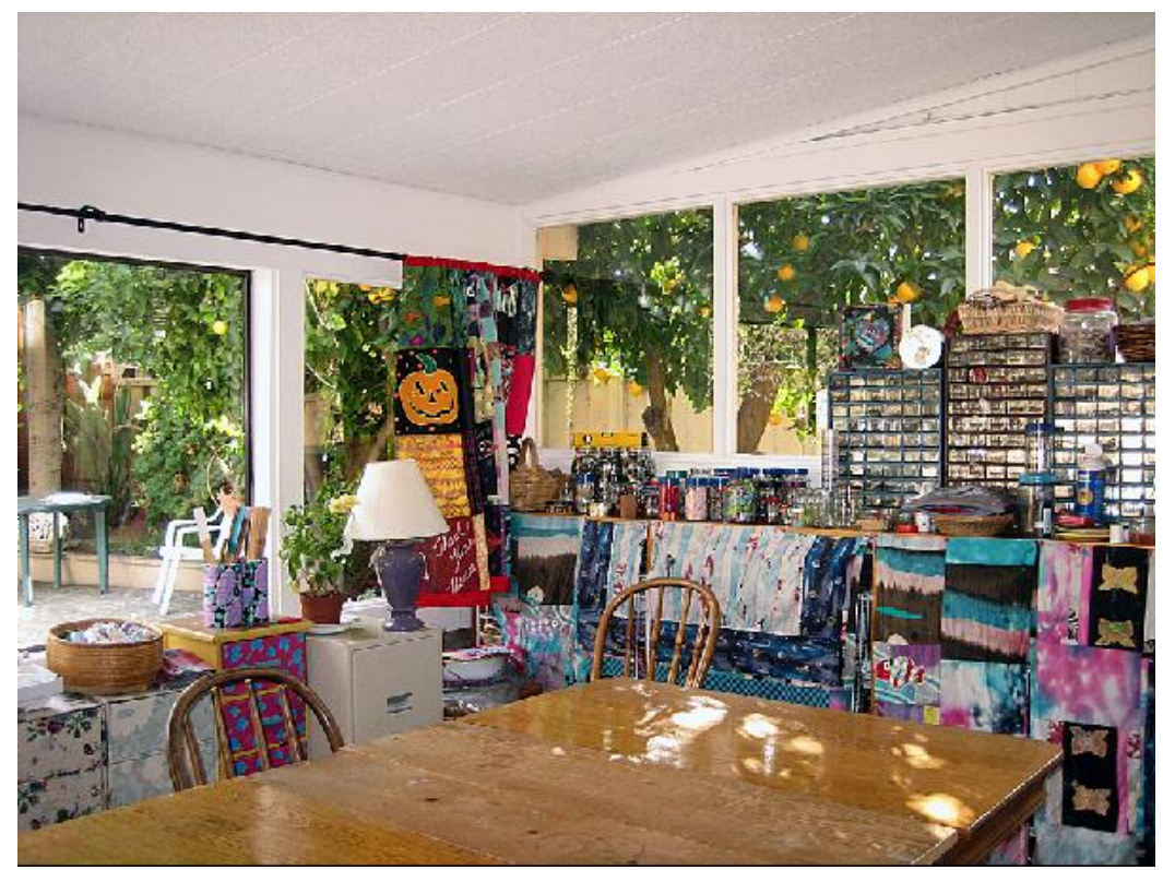
This is just one corner of my studio.